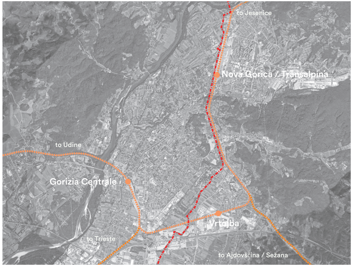
railway net Gorizia / Nova Gorica

Even though the animosities and long lasting traumas based on nationalism have meanwhile widely been addressed, they have not been completely resolved until today. Therefore this post-conflict situation between the two cities offers an ideal basis for peace conversations - also on political conflicts in other geographical contexts. Therefore the slow journey along the barrier/ border can be considered an “exercise” for peace missions.